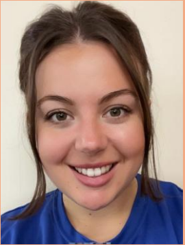
Miss Large Class teacher